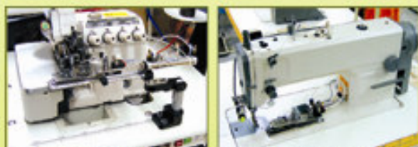
Can be used in different types of sewing machines (to be specified while ordering)

Pneumatic edge guide makes seaming operations more productive and accurate. By automatically keeping seams perfectly aligned, the operator can sew continuously through the length of material, instead of taking frequent stops to re-align the edges. Seam width can be quickly adjusted.